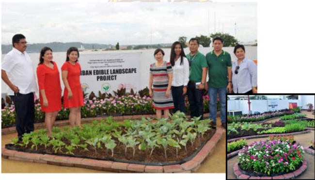
Urban Container Garden