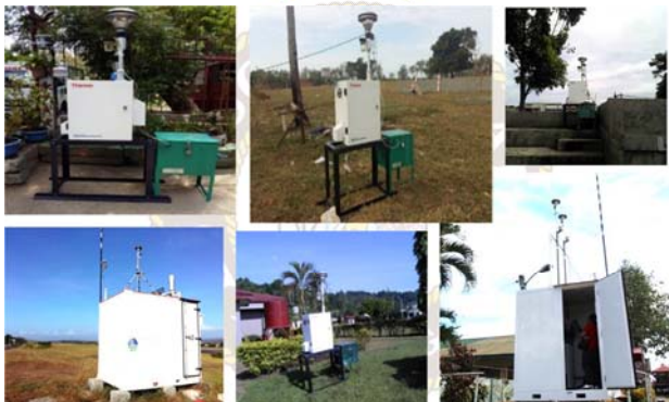
Air Quality Monitoring Stations in 6 locations