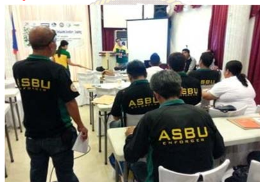
Regular Meeting with the ASB Unit